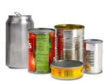
CANS Aluminum and Steel cans (clean, empty, and dry)

Please put ONLY the below materials into the curbside recycling container. Keep them clean, empty, dry, and loose. All recyclables can be mixed together and placed into the cart with the GREEN lid.