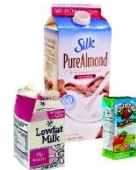
CARTONS (clean, empty, and dry)