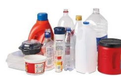
PLASTIC Plastic Bottles, Jugs, and Tubs (clean, empty, and dry)