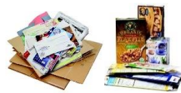
PAPER Cereal Boxes, Paper, Newspapers, Magazines, and Cardboard (all colors and types)