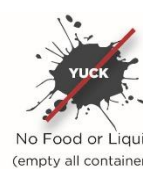
No Food or Liquid (empty all containers)