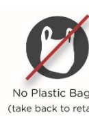
No Plastic Bags (take back to retail)