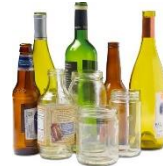
GLASS BOTTLES AND JARS (clean, empty, and dry)